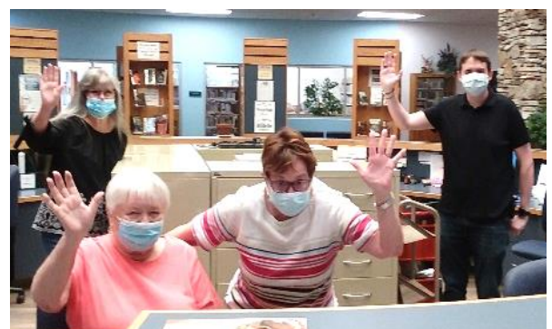
Staff & Volunteers